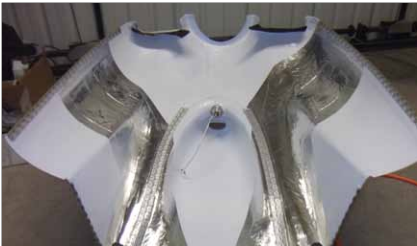
Finished product: Entire inner cowl was sealed and painted, followed by application of Fiberfrax and aluminum foil in areas of close proximity to exhaust pipes.

want it before laying it in the cowl. This is another reason to put down a layer of epoxy—the adhesive backing sticks best to glossy surfaces. I prefer to work from the middle outward, as this seems to minimize the number of creases on compound-curved surfaces. Use the felt edge of a window-tint application tool, available from a car parts store, to smooth the foil as you go. Once finished, mix up some laminating epoxy and paint the edges of the foil with an acid brush. This will prevent oil seeping under the foil as well as the foil lifting.