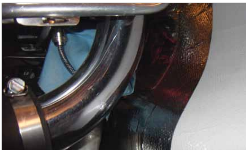
Close-up of Fiberfrax/foil barrier adjacent to an exhaust pipe. (Pipe hidden behind intake runner.) Epoxy to seal the edge has not yet been applied in this picture.

While some builders apply foil to the entire inside of their cowl, this probably isn't necessary. Unless you have extremely close tolerances from the get-go (i.e., less than \frac{1}{2} inch), I'd probably take the first step of epoxy seal/white paint, then go fly. During Phase I, you'll be pulling the cowl off quite a bit anyway to make sure everything is secure, and if you are toasting the cowl, the paint will tell you pretty quickly. However, once you've got your base layer of epoxy and paint, applying the Fiberfrax and aluminum won't take more than a few hours and will add less than a pound of weight, so don't be afraid to take a preventative approach. Given how much many builders hate fiberglass work (and how expensive cowls are), this is one case where an ounce of foil is worth a pound of Bondo. Good luck, and stay cool! ✚