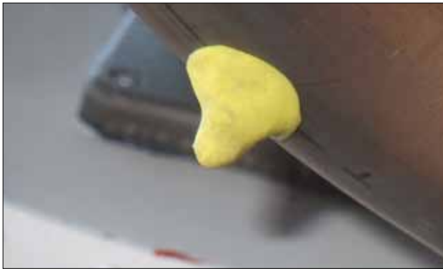
Clay cone stuck to the exhaust pipe to check for clearance.