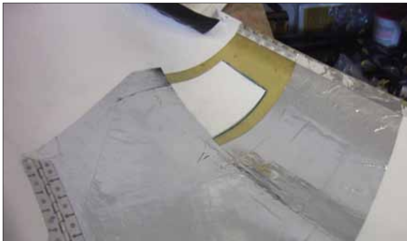
Here we can see the Fiberfrax, which has already been glued to the inner cowl with Pliobond, being covered with the adhesive foil.

At a minimum, simply painting the interior of the cowl white or silver will help to reflect radiant heat, as well as