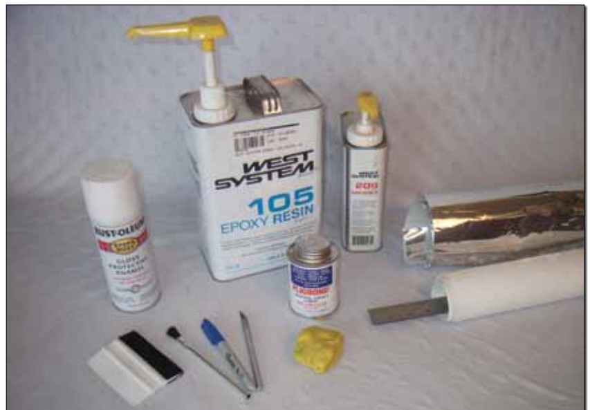
Here's what you'll need (clockwise): Laminating epoxy, adhesive-backed foil, Fiberfrax and a straightedge, a half pint of PlastiBond adhesive, modeling clay, a sharp X-Acto knife for trimming the foil, a Sharpie for template layout, an acid brush to seal the edges of the foil with epoxy, a window-tint applicator, and paint.

So, what kind of clearances does Vetterman recommend? "For unprotected fiberglass, I would recommend not less than 1½ inches of clearance. For fiberglass with either foil or silver paint, you can reduce that to ¾ inch." The addition