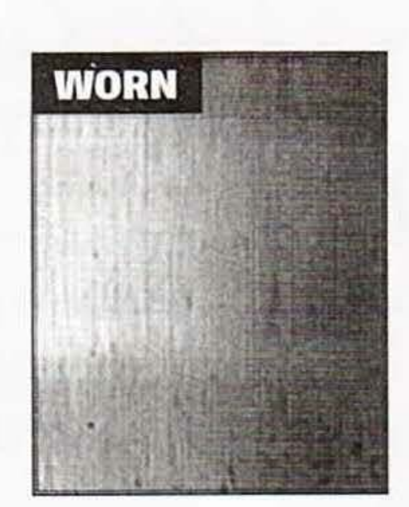
A simple borescope inspection is the best way to tell which cylinder(s) is/are worn to the point of causing excessive blow-by. A compression test is much less reliable.