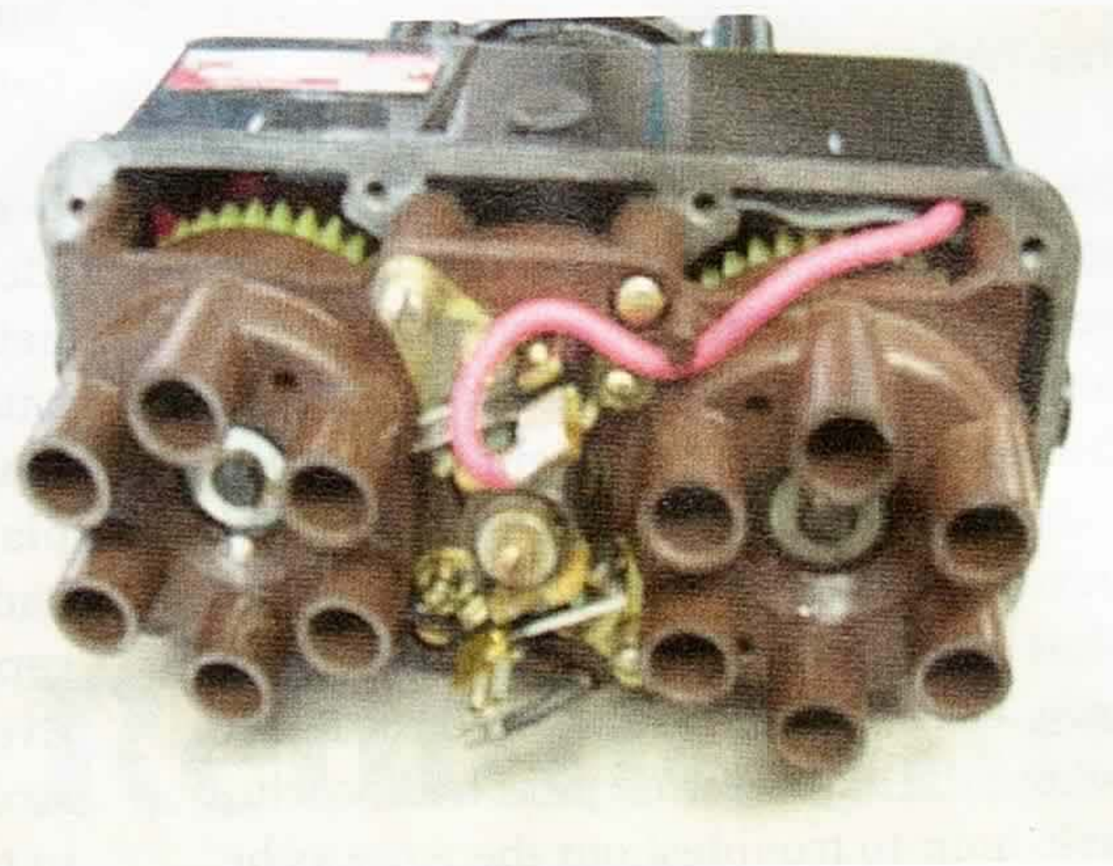
Figure 2—The Bendix D2000/D3000 dual mag is basically two independent magnetos packaged into a single unit.