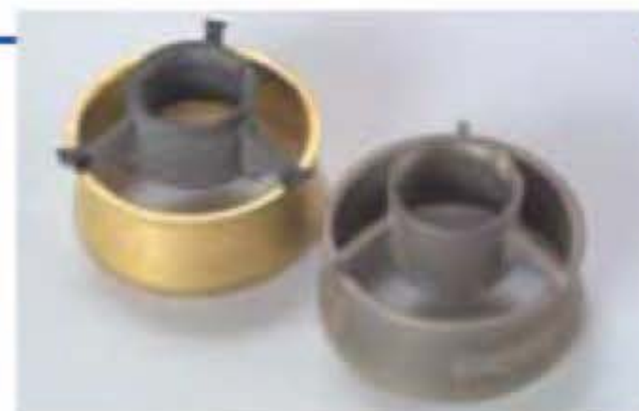
Venturis. The two-piece venturi (above left), is subject to annual and 100-hr inspections as per AD 98-01-06. Single piece venturi (above right) requires no recurrent inspections. Carburetor data tags with 'V' stamped on them indicate that the single piece venturi has been installed.

A common misunderstanding through the years has been that an engine/carburetor combination that works well in one airplane will function as well in another style air-