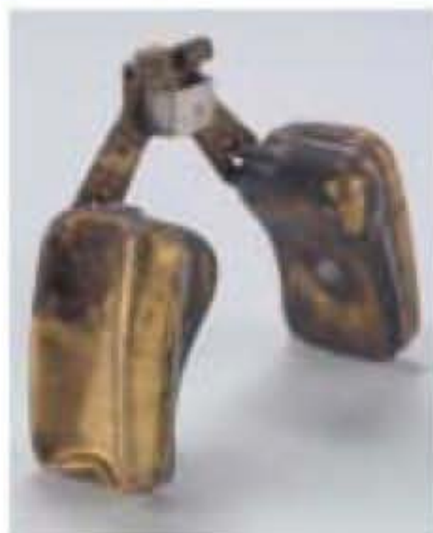
Photo shows a collapsed brass float. Never introduce shop air to the inlet fitting, discharge nozzle, or fly holes in the throat of the carburetor — the high pressure might collapse the float.

Sure, your high-end fuel flows begin to look better and so do your CHTs and EGTs. But unfortunately, mid-range fuel flows may become exceedingly rich. This rich condition is especially apparent as you transition between idle and full power. An engine that bogs down rich may surprise a pilot forced to do a go-around when on short final. Actuating the throttle causes