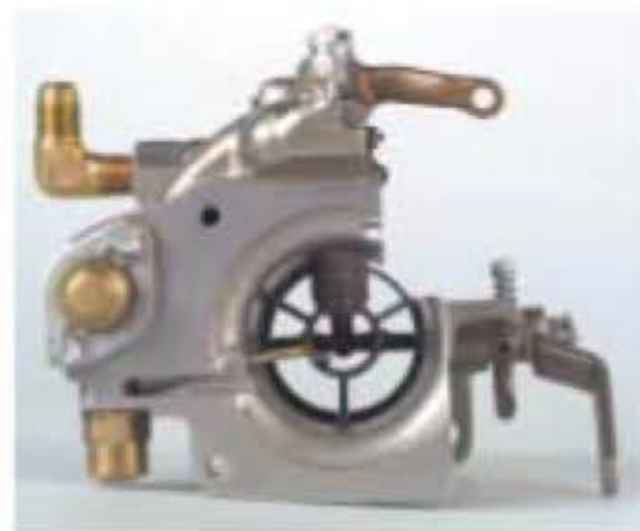
Looking up the throat of the MA-4SPA Carburetor. This vantage point reveals the proper placement of the pump discharge tube. The tube must be positioned just within the center ring of the primary venturi.

At low rpms, the idling system is independent of the main metering jet. At idle speeds and up to approximately 1,000 to 1,300 rpm the main jet has little or no fuel passing through it. This is because the throttle valve is almost closed and there is little air swept past the discharge nozzle. At this point, fuel is drawn up the idle bleed tube in the bowl and then through the idle emulsion channel within the throttle casting to ports adjacent to the upper edge of