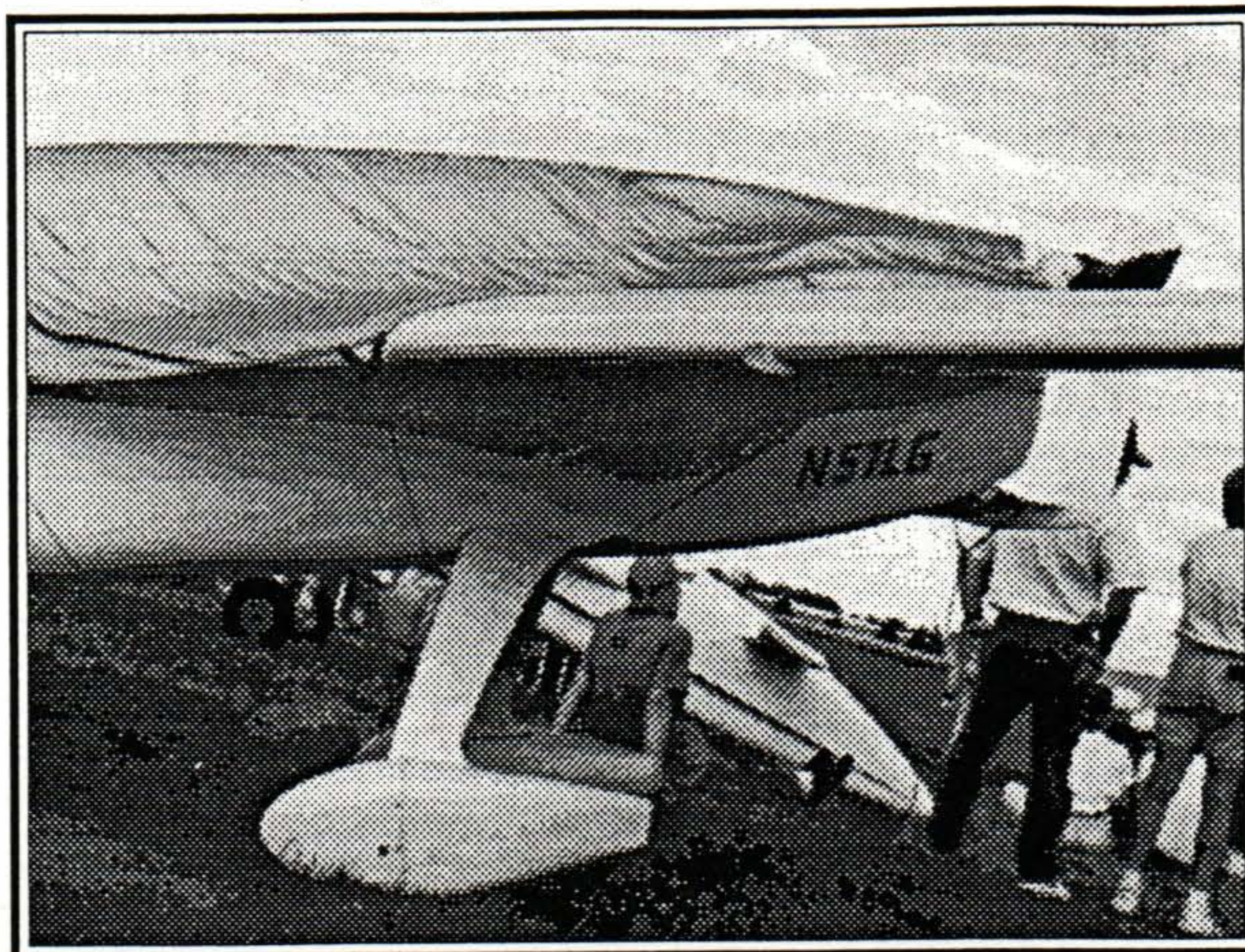
Klaus' boat tail winner

Lets quit dragging our fannies around the sky and see what can be done to get more speed from these slick birds.