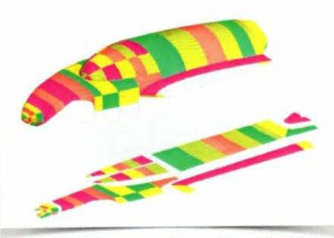
Cozy MkIV Canopy/Nose/Engine Cover, 3D model

For older airplanes in need of protection while living outdoors, complete cover sets are available. Custom made for all or your plane's mods and modifications.