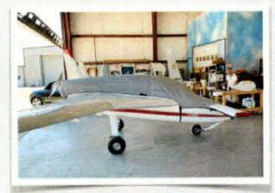
Cozy Mk IV Canopy/Nose/Engine