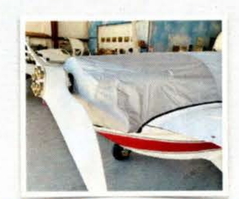
Cozy Mk IV Canopy/Nose/Engine