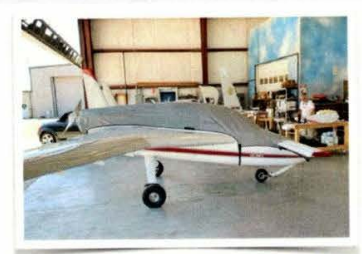
Cozy Mk IV Canopy/Nose/Engine Cover, travel weight design

For older airplanes in need of protection while living outdoors, complete cover sets are available. Custom made for all or your plane's mods and modifications.