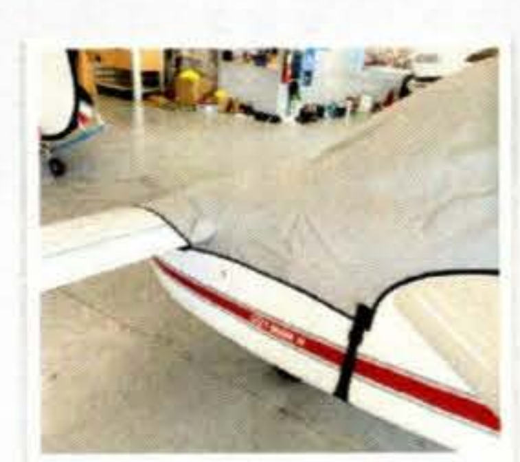
Cozy Mk IV Canopy/Nose/Engine