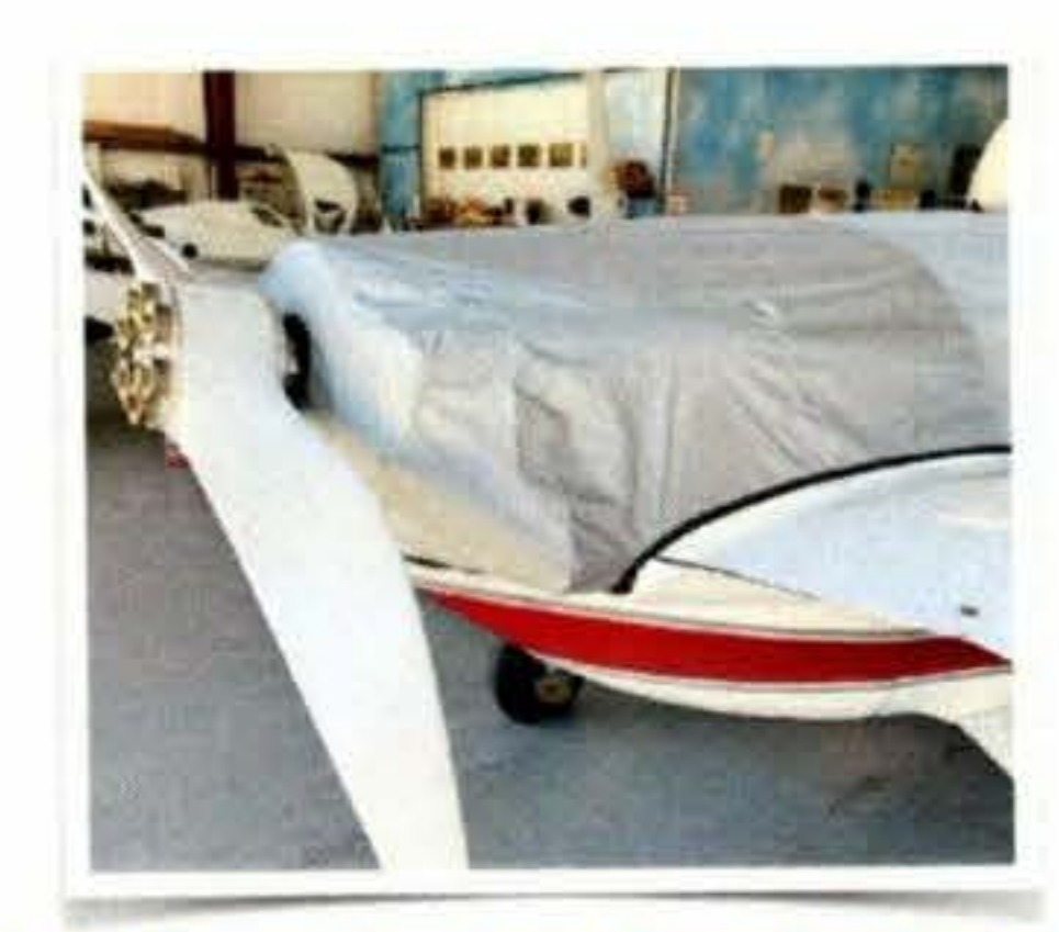
Cozy Mk IV Canopy/Nose/Engine Cover, travel weight design

Bruce uses advanced 3D modeling techniques to develop the closest fitting covers possible for every make, model and modification.