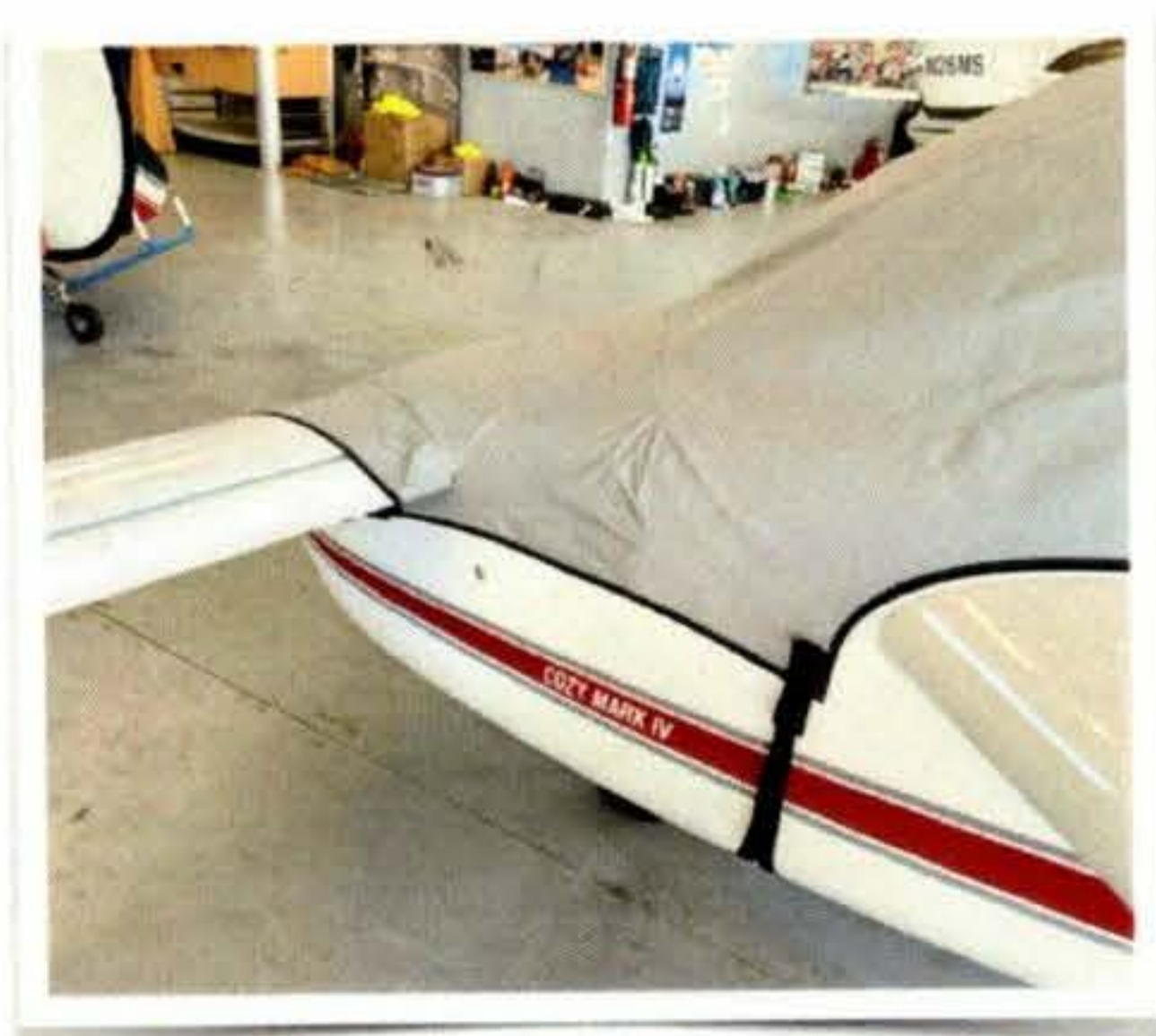
Cozy Mk IV Canopy/Nose/Engine Cover, travel weight design

Canard style airplanes can be difficult to fit because of constructions variations in homebuilt aircraft. Consequently we design our covers to fit the individual aircraft using photos, measurements and customer input.