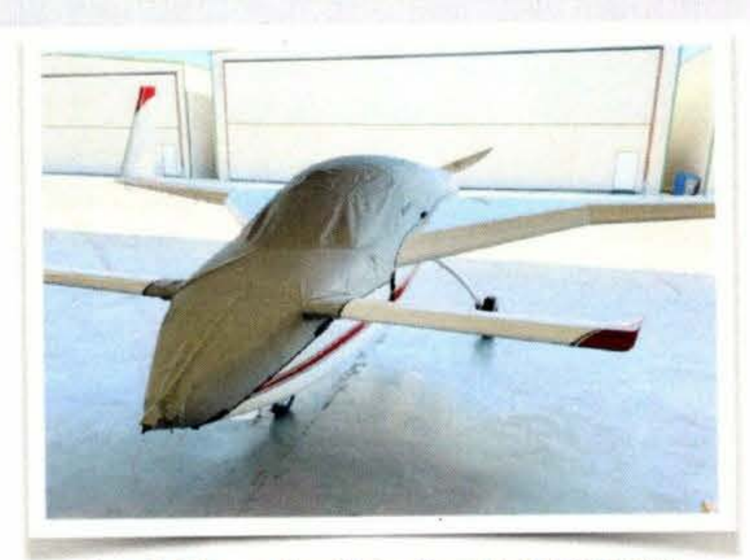
Cozy Mk IV Canopy/Nose/Engine Cover, travel weight design

Canard style airplanes can be difficult to fit because of constructions variations in homebuilt aircraft. Consequently we design our covers to fit the individual aircraft using photos, measurements and customer input.