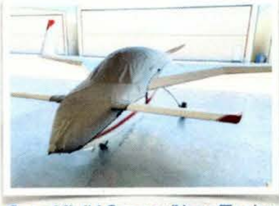
Cozy Mk IV Canopy/Nose/Engine

SCAN HERE to view these products - and more - online.